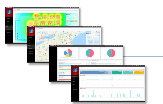
*NMS is built-in with Edimax Pro CAP, WAP series & OAP1750 access point. For SKYMANAGE PC, please contact Edimax authorized distributors or SIs to download the software.